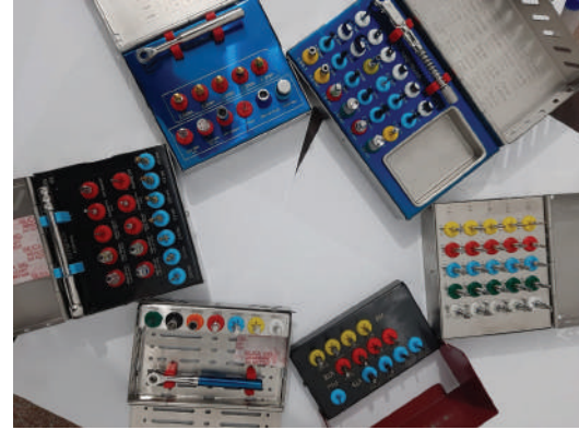
ART NO, DIX-626