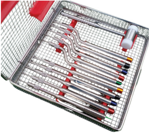
ART NO, DIX-617