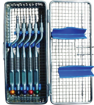
ART NO, DIX-620