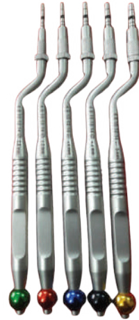
ART NO. DIX-607