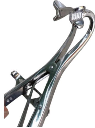
ART NO, DIX-614