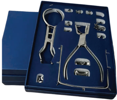
ART NO,DIX- 619