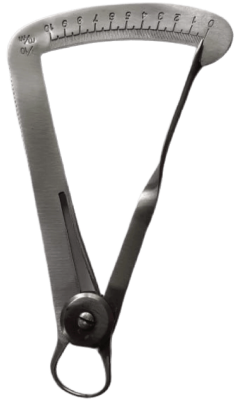
ART NO, DIX-630