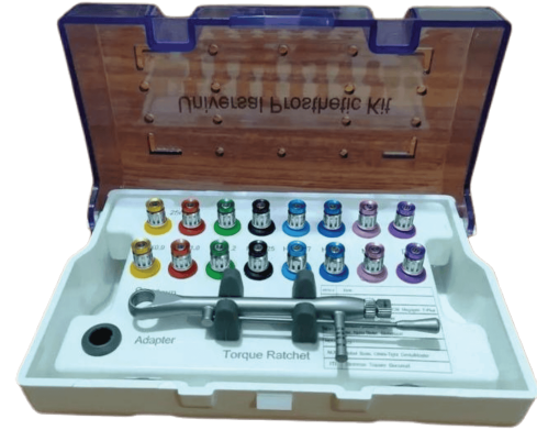
ART NO, DIX-622