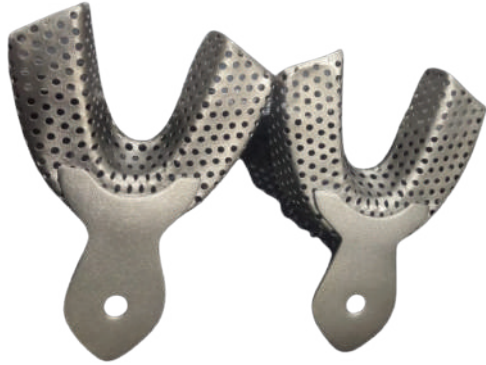
ART NO, DIX-621