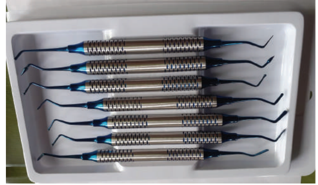
ART NO, DIX-629