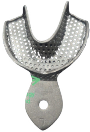
ART NO- DIX - 615