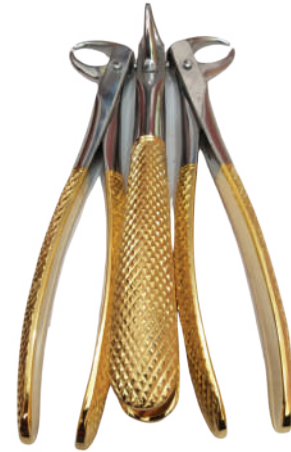
ART NO. DIX-618