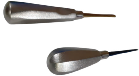
ART NO, DIX-616