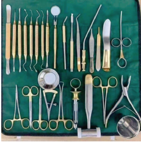
ART NO, DIX-625