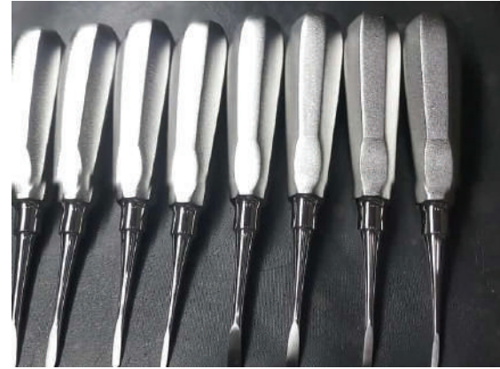
ART NO, DIX-634