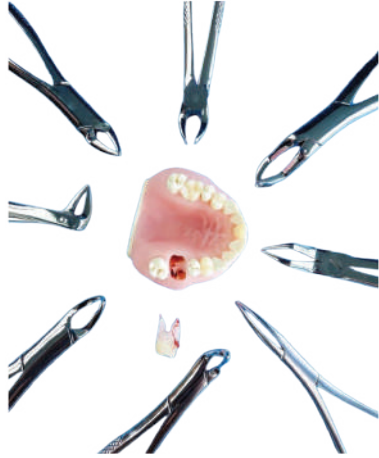
ART NO, DIX-613 SET of 8 pcs