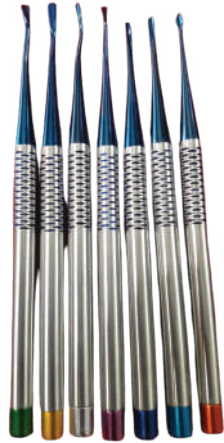
ART NO, DIX-608