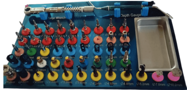
ART NO, DIX- 624