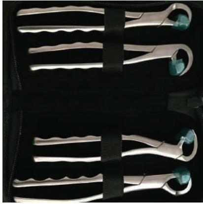
ART NO,DIX -636