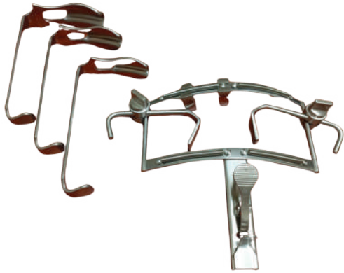
Art no, 601 German material