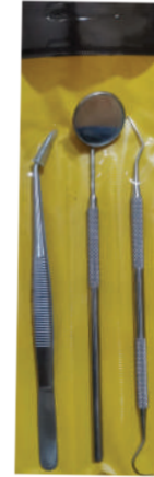
ART NO, DIX- 603