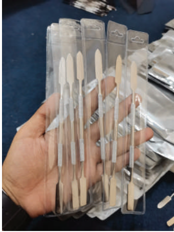
ART NO, DIX- 604