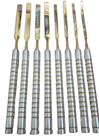
ART NO, DIX-609