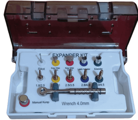
ART NO, DIX-635