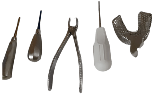
ART NO, DIX-628