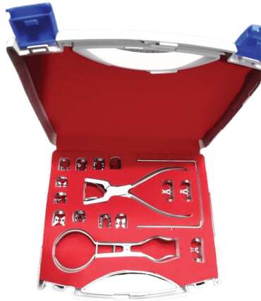
ART NO, DIX-623